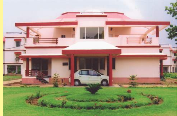
All India Institute of Medical Science (AIIMS) at Patna