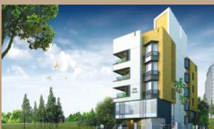
Regent Sapphire at Kolkata, West Bengal