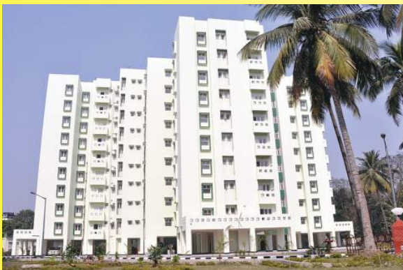
Fort William, Kolkata