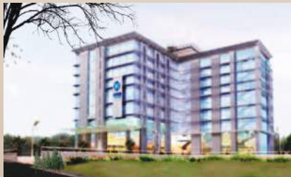
Legend Mint at Hyderabad, Andhra Pradesh