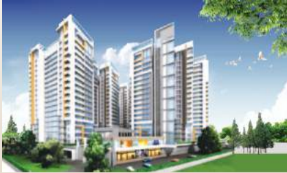
Harmony at Hyderabad, Andhra Pradesh