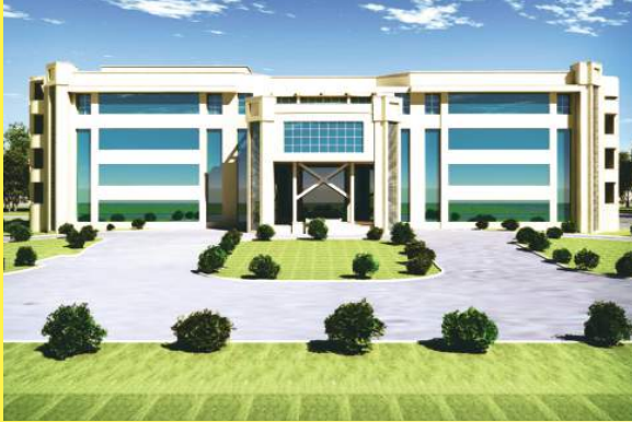
Indian Institute of Chemical Biology (IICB) at Salt Lake