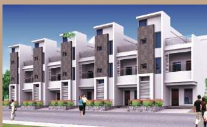
Legend Marigold at Hyderabad, Andhra Pradesh