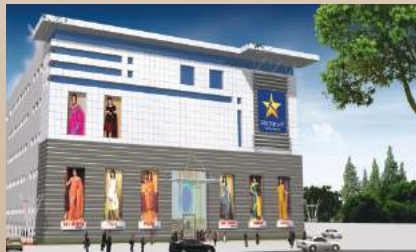
Regent Textile Market at Surat, Gujarat