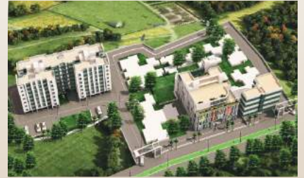
Regent Crown at Burdwan, West Bengal