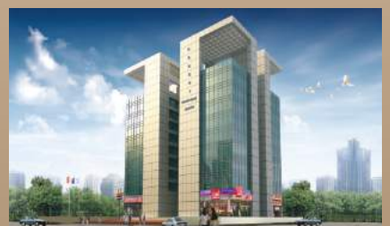
Regent Knowledge Centre at Surat, Gujarat