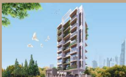
Regent Sea View at Mumbai, Maharashtra