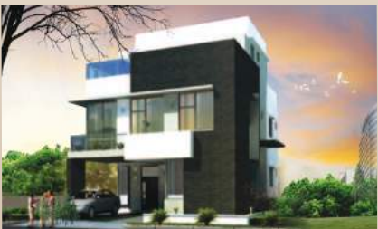
Legend Ocarina at Hyderabad, Andhra Pradesh