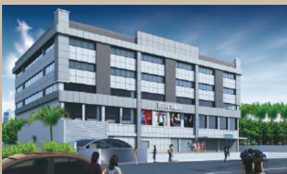
Regent Square at Surat, Gujarat