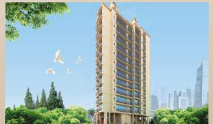
Regent Hema Niwas at Mumbai, Maharashtra