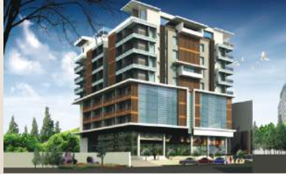
Blue Legend Hope at Hyderabad, Andhra Pradesh