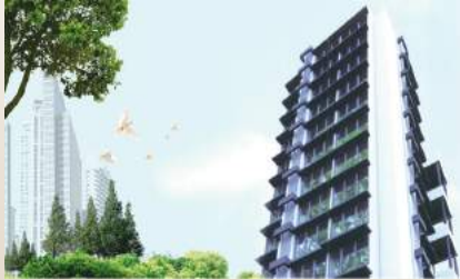
Regent Darshan View at Mumbai, Maharashtra