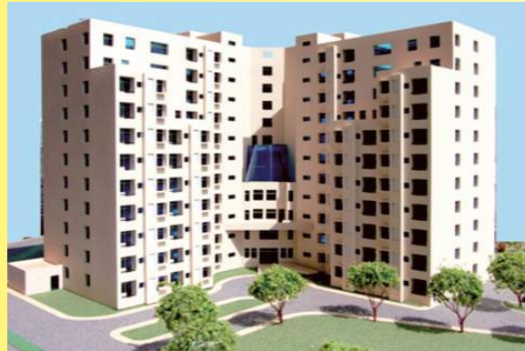
All India Institute of Medical Science (AIIMS) at New Delhi