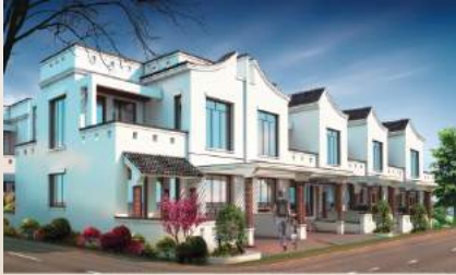
Unique City at Jaipur, Rajasthan