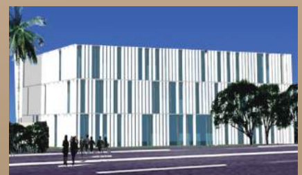
Regent Centre at Burdwan, West Bengal