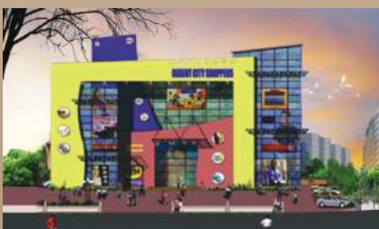
Regent City Shoppers at Howrah, West Bengal