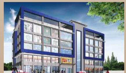
Regent Centre at Uttarpara, West Bengal