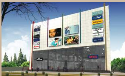
Regent Arcade at Surat, Gujarat