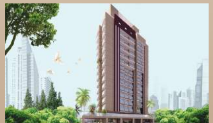
Regent Heights at Mumbai, Maharashtra