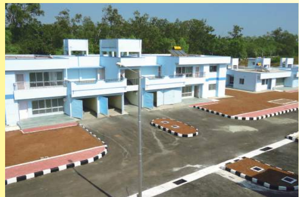
Ministry of Defense (MOD) at Chennai