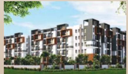
Legend Omega at Hyderabad, Andhra Pradesh