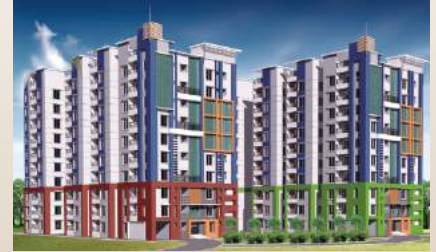
Legend Coconut Grove at Hyderabad, Andhra Pradesh